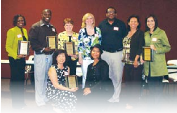
Class II of Project A.L.L.